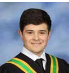
Ryan Little Lighting in the Film Industry