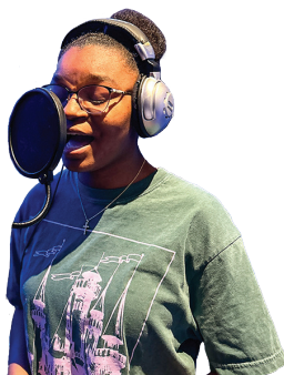
Singing for Ascension music album